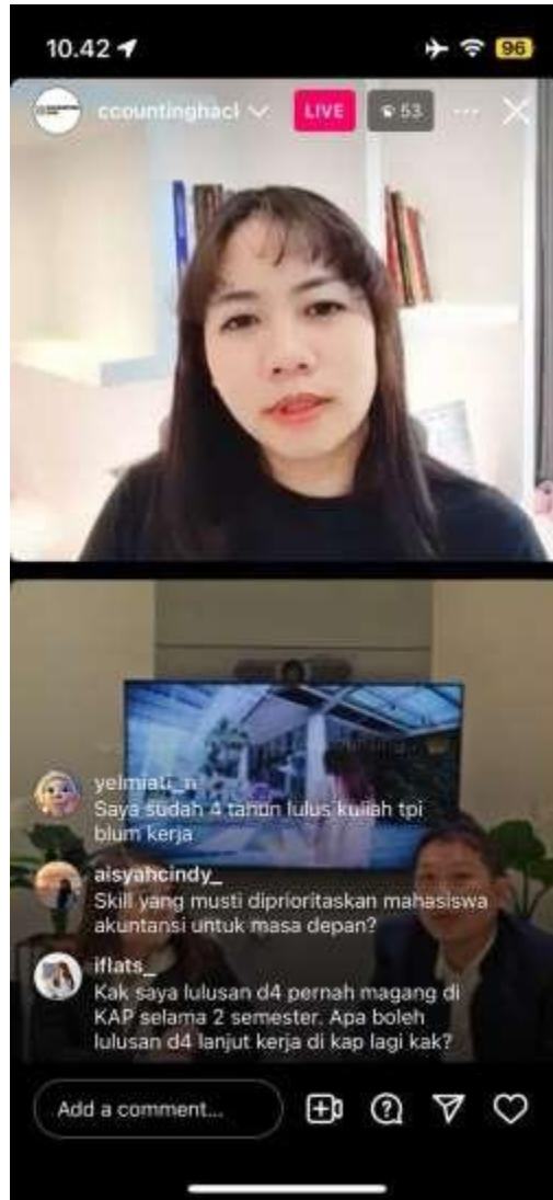
Fig 3 Activity Photos

The 4 th International Conference on Entrepreneurship