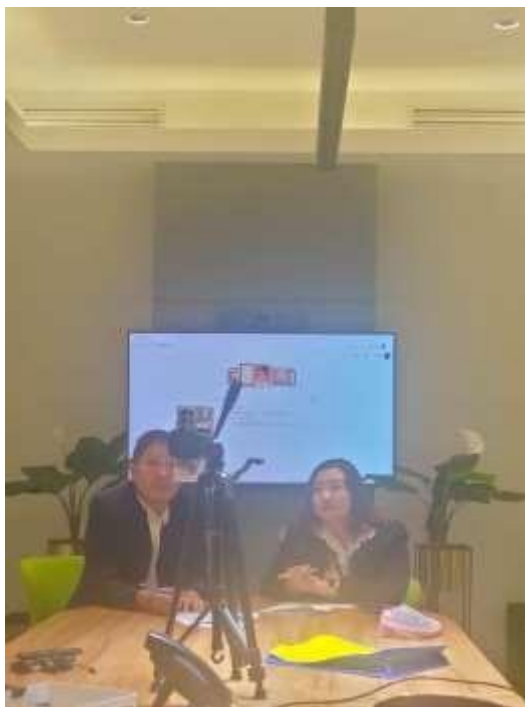
Fig 2 Activity Photos