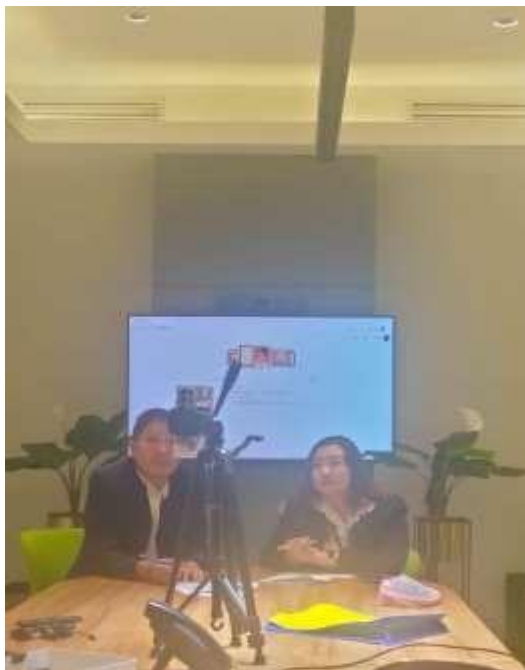
Fig 2 Activity Photos

The 4 th International Conference on Entrepreneurship