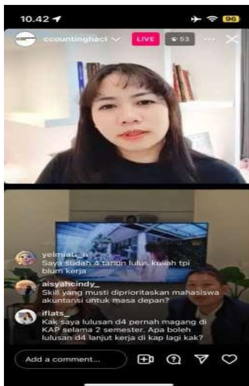
Fig 3 Activity Photos