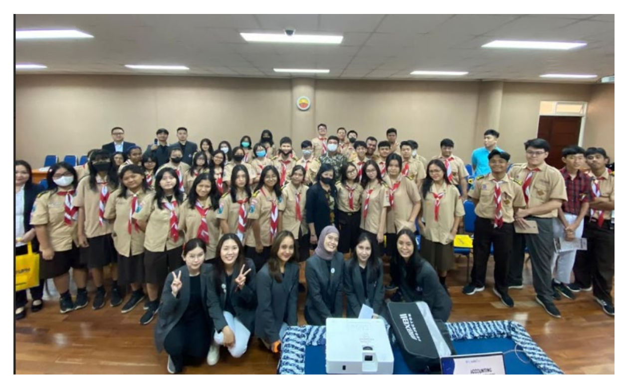
Figure 3, PKM Team, Student Committee, and participants