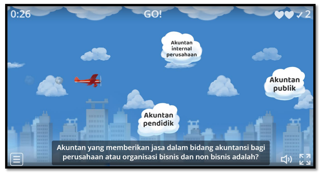
Figure 2. Airplane Game

As the event's final moments drew near, participants reflected on the journey they had embarked upon together, grateful for the knowledge gained and the friendships forged along the way. With hearts full and minds enriched, they bid farewell to the school hall, their spirits buoyed by the memories of a day filled with learning, laughter, and shared experiences. As they dispersed into the twilight, each carried with them the promise of new horizons and the assurance that the bonds of the community would endure long after the echoes of the day had faded into memory.