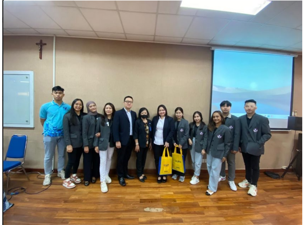
Figure 5. PKM Teams

an average answer of 4.3. Based on existing data, most workshop participants felt the benefits of the material presented, especially the words scramble games regarding the accounting profession in the future.