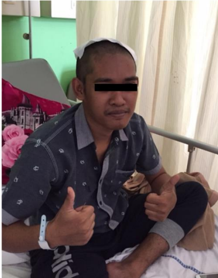
Figure 3. Post operative general condition

For antibiotics, we gave Ceftriaxone 4g/ day and Metronidazole 1500 g/ day. Patient was discharged on the 7 th post-operative day without any sequelae (Figure 3).