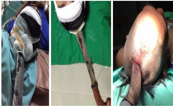
Figure 1. Macroscopic view of a penetrating craniocerebral injury caused by a machete, whose point of penetration is visible in the mid parietal region

Head computed tomography (CT) scan and 3D reconstruction was performed showing an open depressed skull fracture; with the weapon lodged in the mid parietal bone with a depth of approximately 6 to 7 cm. There was impression of both external and internal parietal bone tables and caused a slight subarachnoid hemorrhage. Because of the artifact, we could not determine the relationship between the objects and superior sagittal sinus (Figure 2).