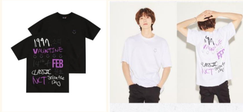
Figure 1. Scarp Short T-Shirt from www.hypermalaysia.com

designed by Jaehyun himself. But unfortunately, there are some people in Indonesia who carry out the design plagiarism and then resell it, one of them is through a platform on a marketplace like Shopee. The following are original product designs and product designs that are the result of plagiarism: