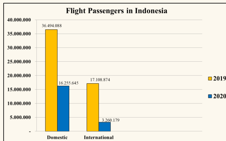
Figure 1. Number of Flight Passengers in Indonesia in 2019 and 2020 4

The Covid-19 pandemic has negatively affected various business sectors globally and nationally, one of which is the aviation sector. Referring to data from the Central Statistics Agency, 3 the number of Indonesian domestic flight passengers throughout 2020 decreased by 55.46% compared to 2019, reaching 36.5 million people in 2019 to 16.3 million people in 2020. International passenger traffic decreased by 80.94%, from 17.1 million in 2019 to 3.2 million in 2020 (Figure 1).