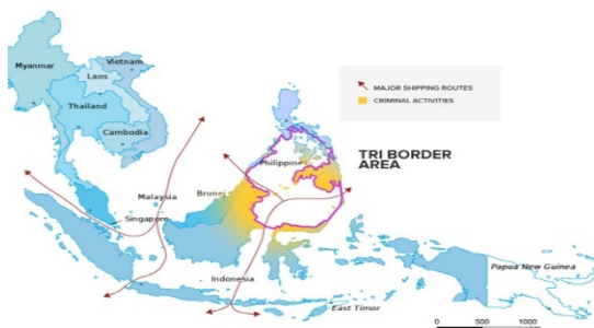
Figure 3.2 Map of the Sulu-Sulawesi Seas

Maritime security in the Sulu-Sulawesi Seas plays prominent role in determining the development of global terrorism, particularly IS' operation in the region. Due to its strategic location, the Sulu-Sulawesi Seas are important because they facilitate the cross-border movement of millions of people as well as international navigation. According to one recent estimate by the Indonesian foreign ministry, every year more than 100,000 ships pass through the Sulu-Sulawesi Seas carrying 55 million metric tons of cargo and 18 million passengers (Parameswaran, 2016).