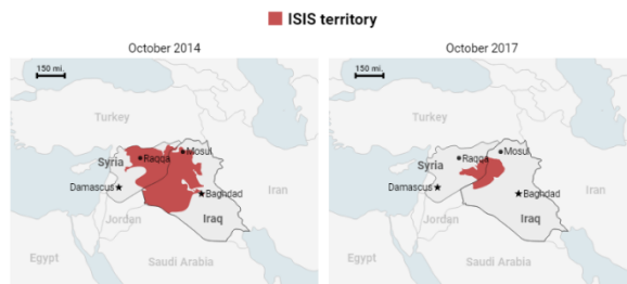
Figure 1. 2 Comparison of IS-controlled Territory in Syria

In October 2014, the radical Islamist group controlled the central Syria all the way to the outskirts of Baghdad therefore IS territory in Syria and Iraq was at its maximum (see Figure 1.2). However, the map showed in 2017 that IS had lost large of its territory and now is only limited to the sparsely inhabited border territories between Iraq and Syria (Kranz & Gould, 2017). Although IS is facing great territory losses in the Middle East, the threat remains challenging. According to UN research, there is still up to 300,000 of IS fighters in Iraq and Syria (McKernan, 2018).