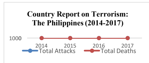
Figure 3.1 Terrorism Activities in the Philippines 2014-2017

The figure above shows that from 2015, terrorist attacks in the Philippines were around 480 to 500 incidents (see Figure 4.4). The total deaths are increasing significantly until it reached its peak point in 2017 with 327 victims from 260 victims in 2015 (START, 2017). This data proves that the presence of IS in the country has inspired the IS-affiliated group such as AKP, Maute, and BIFF to commit more of terrorist attacks. The government has been officially acknowledged some attacks which suspected IS-affiliated groups as the perpetrator.