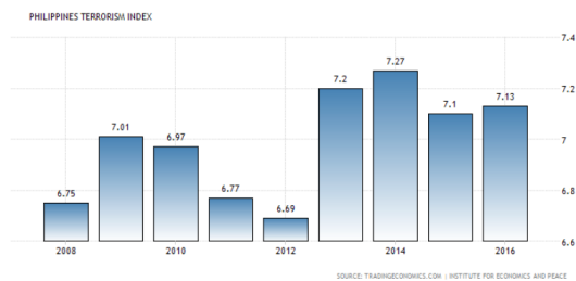
Figure 1.3 Philippines' Terrorism Index

According to the Philippines Terrorism Index, the terrorism index in Philippines increased to 7.13 in 2016 from 7.10 in 2015 (see Figure 1.1). The average is 6.65 from 2002 until 2016, reaching an all-time high of 7.27 in 2014 (Trading Economics, 2018). Surprisingly, the Philippines ranks 12 out of 162 countries worst affected by terrorism, according to the Institute for Economics and Peace's Global Terrorism Index for 2014 (Guzman, 2016). By the data shown, it depicts the emerging threat of the terrorism, particularly coming with the presence of IS in the Philippines which conducts attacks on government forces, and bombings in the country.