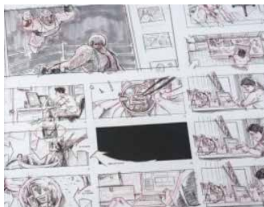
Figure 4. A sample case study of an artbook storyboard for the Amazing Spider-Man film..

it is not designed from this storyboard , there is a high probability that all the objects and objects in one frame will look so messy and ruin the beauty in the frame.