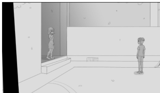
Figure 1. Sketch from the author as an example. (Author, 2021)

In the composition, Ed Ghertner explains that when taking a shot, it consists of extremely long shots, long shots, medium shots, close-ups, extreme close-ups. Then the next theory from Ed Ghertner puts objects correctly so that they look balanced and can give direction, place objects properly so that the background is not blocked so that the foreground also doesn't damage the composition, gives space for characters to move, and finally, composition upshot, down shot, angled angles to dramatize scenes in the story. To make an example in the novel, the author takes part of the story when the Angle stands in a dark place while his friend is in a bright area, using the theory of making a statement, then by placing the character who is always in a dark place. An example is shown in Figure 1 below.