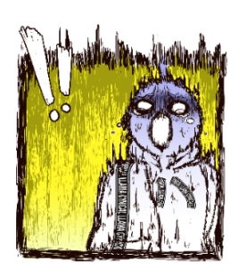
Figure 3. Application of Panel Personification

While previously the panel is imagined as a camera, in this part the panel is imagined as a character, by giving a human characteristic to a non-human object. This can be achieved by changing the panel border characteristic. Rather than simple straight lines, something like a squiggly line or some sharp repetitive lines can also be used to convey certain emotion. This is called a panel personification. This technique emphasizes the emotional condition that is being showed by the character inside the panel. For example, the character is shocked from touching something wet from inside a pouch (Figure 3). Other than drawing the character with an exaggerated shocked expressions the panel around it can also play along by being drawn in exaggerated strokes. Then, when animating, it could just be series of looping images of two frames and from that the timing is adjusted to fit the emotion being convey from the character inside the said panel.