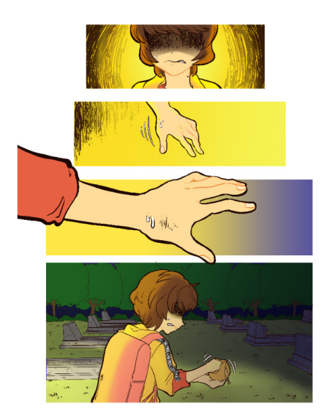
Figure 4. The Application of Gestalt's Closure Action-to-Action in Panel Transition

This part is going to discuss the use of action-to-action in one page to show the transition of action between the panels. The page starts with a small panel slowly transitioning to a bigger panel to emphasize the intensity and the importance of each movement made by the character in each panel (Figure 4). The movement made by a single subject is called action-to-action. With this kind of panel composition where the size is getting bigger with each panel that comes after one another, a sense of hierarchy is created within the indicated page.