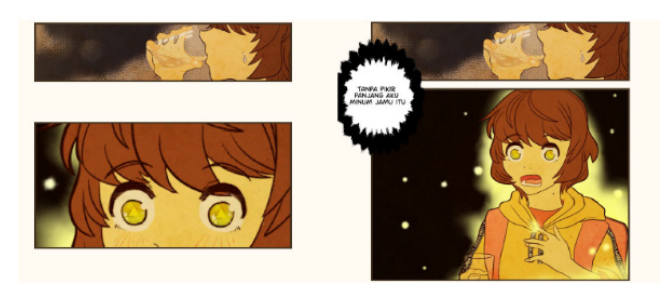
Figure 1. Panel Transitioning from Extreme Close Up to Medium Shot

achieved by changing the size of the panels. For example, panel A is an extreme close-up and wants to transition to panel B a medium shot (Figure 1). First, panel A is going to be smaller while the image of focus is going to be bigger. Then, when transitioning to panel B, make the image smaller while the panel bigger (Figure 2). This creates the before mentioned cinematic transition, a transition from extreme close-up to medium shot without creating a new panel. Other than that, it also creates the illusion of depth and parallax.