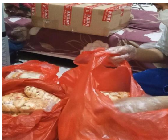
Figure 2. Packaging Chips BangJo

In addition, the availability of "Keripik Bangjo" online makes it easier for consumers. To get a product, this is where And when. As it is an online platform, consumers can easily purchase without going to the store. This expands the market reach and increases the accessibility of products for consumers. With this, innovation in processing cassava into chips has brought great benefits to the community and opened up promising business opportunities in the future.