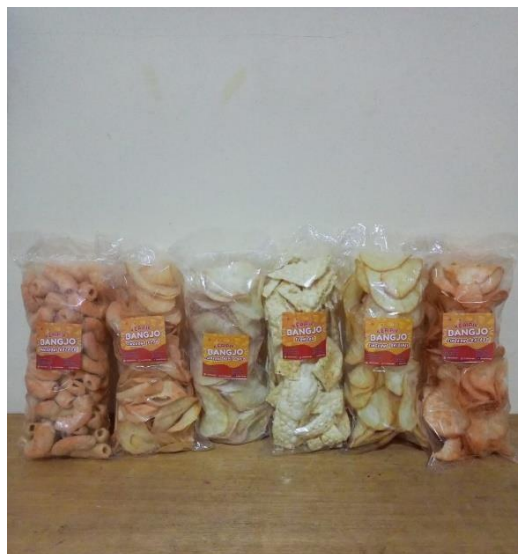
Figure 1. BangJo Chips

Innovation in processing cassava into more attractive products is needed to face these challenges. One solution is to present practical and delicious cassava chips. Innovation This answer needs to be done in an era now dominated by snacks or treats. Through the brand "Keripik Bangjo," consumers can enjoy cassava chips That Are not only nice but also rich in nutritional benefits. The advantages of this product lie in its authentic taste and content. Nutrition is tall so that it gives pleasure when enjoyed and provides health benefits.