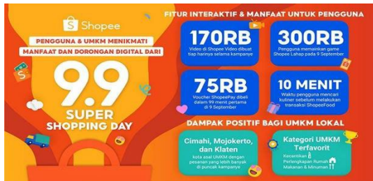
Figure 1. Antusiasme Shopee 9.9 Super Shopping Day 2023