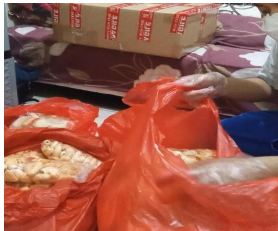
Figure 2. Packaging Chips BangJo

In addition, the availability of "Keripik Bangjo" online makes it easier for consumers. To get a product, this is where And when. As it is an online platform, consumers can easily purchase without going to the store. This expands the market reach and increases the accessibility of products for consumers. With this, innovation in processing cassava into chips has brought great benefits to the community and opened up promising business opportunities in the future.