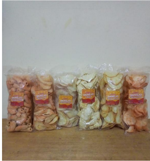
Figure 1. BangJo Chips

Innovation in processing cassava into more attractive products is needed to face these challenges. One solution is to present practical and delicious cassava chips. Innovation This answer needs to be done in an era now dominated by snacks or treats. Through the brand "Keripik Bangjo," consumers can enjoy cassava chips That Are not only nice but also rich in nutritional benefits. The advantages of this product lie in its authentic taste and content. Nutrition is tall so that it gives pleasure when enjoyed and provides health benefits.