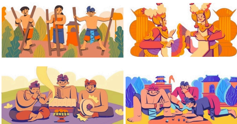
Image 2 Mural design (Source: Bali Institute of Design and Business, 2020)