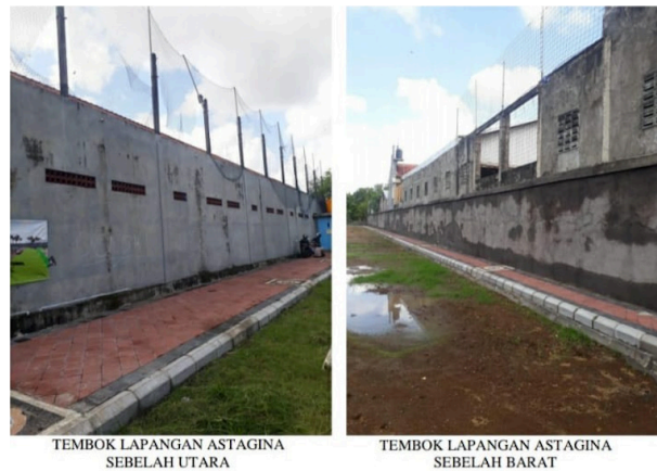
Image 1 Astagina Field Wall which will be beautified with murals

This mural activity was carried out from 7 November - 12 December 2020 by involving collaboration between lecturers and students of the Bali Design and Business Institute. The location of the mural is carried out on the northern part of the Astagina Field wall where the part of the wall faces the field and is very easily seen by residents or tourists who come to the village. In the visual design of the murals, the design team makes the design by following the design draft that has been determined both in terms of characters and colors. The characters use children's characters to describe the younger generation who will continue the village potential in Porsenides and preserve Balinese culture in the future.