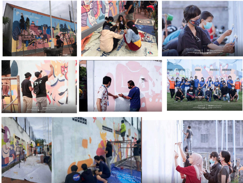
Image 3 The activities of Mural design and the interaction that happened in the mural design process

In this activity, there is also happen a social interaction, where the mural is also one of the activities that are rarely witnessed by the people of Padang Sambian Kelod Village. The villagers feel attracted to watch and even get involved in mural activities. During the Covid-19 pandemic, Astagina Field can only be used for certain activities with a limited number of people. This certainly affects the activities of the people who usually visit the Astagina field every day. Therefore, this mural activity becomes an alternative activity that can entertain residents in a pandemic situation that has made them feel isolated. Several residents coming to the Astagina field to watch the mural implementation process and some children wanted to help with the mural implementation. Although the village community cannot follow all the mural design processes, we hope that the message of cultural preservation for the younger generation could be conveyed. After the mural was completed, a handover process was held between the Bali Design and Business Institute and Padang Sambian Kelod Village officials.