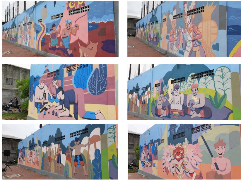
Image 4 The Final Result

Based on the analysis after this mural is implemented, it can be concluded that the city branding strategy of Padang Sambian Kelod Village is following the indicators, namely: