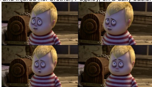
Image 8. Pugsley Addams's Expression

The word "torment" implies an adverse action, an intentional act to injure or harm others in purpose. When the dialogue is interpreted denotatively, it implies that Wednesday Addams purposely annoyed and injured her brother, Pugsley, on a daily basis.