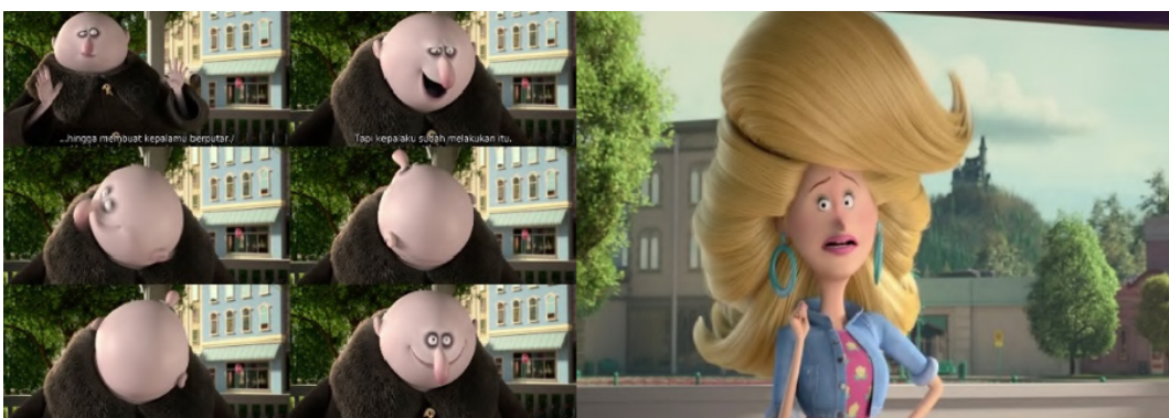
Image 4. Fester Addams and Margaux's Response. (Source: The Addams Family (2019))

Margaux offered the Addams family a quick home renovation and implied that it would not take long by adding, "It makes your head spin." Margaux persuaded the family to agree to her offers. However, Fester's response was unusual. Fester took Margaux's words literally and spanned his head, which caused Margaux reacted uncomfortably.