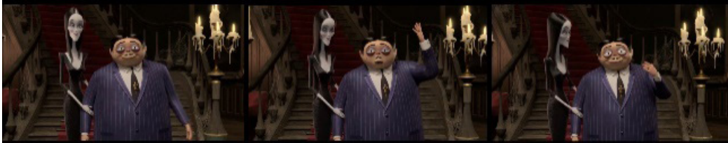
Image 2. Gomez Addams’ Body Gesture. (Source: The Addams Family (2019))

Perceiving from the literal meaning (denotation) of Barthes’ semiotics, Gomez’s response was a form of disapproval for Margaux’s arrival at the Addams family residence since she came at the unanticipated time. However, when perceived from the film context, the sentence “worst” uttered by Gomez was the opposite; Margaux’s arrival was anticipated. In this scene, the denotation meaning becomes connotation meaning since it has additional context.