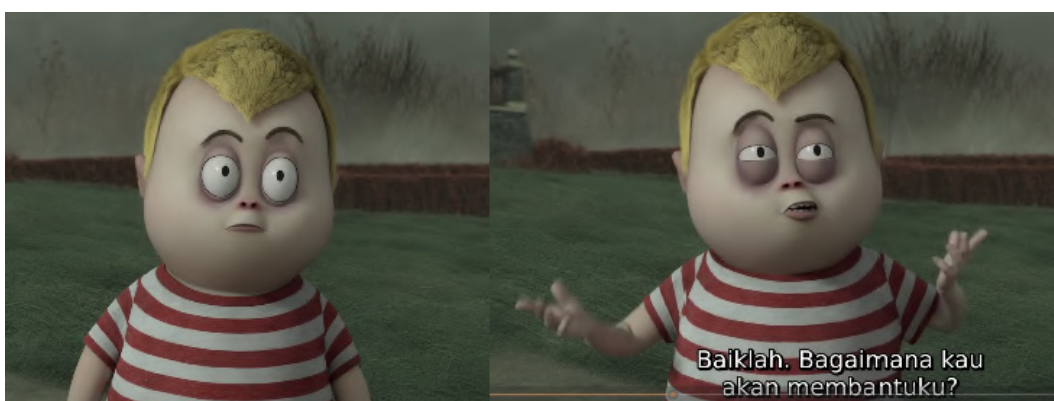
Image 6. Pugsley Addams's Response. (Source: The Addams Family (2019))

Wednesday's words, contrasting her facial expressions and gestures, will confuse others. Otherwise, Pugsley, who knew her personally, knew how to respond and acted normally as Wednesday did those words, gestures, and expressions repetitively previously. Despite her facial expressions, Wednesday Addams implied denotation meaning in her words that Wednesday cared and was willing to help Pugsley.