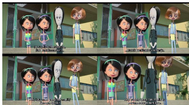
Image 7. Wednesday with Her Friends (Source: The Addams Family (2019))

'mall' as 'maul,' which changed the context entirely to what she responded afterward; 'mall' as a common place for socializing becomes 'maul' as a violent action to attack or to injure others.