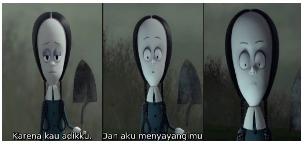
Image 5. Wednesday Addams's Expression. (Source: The Addams Family (2019))

Wednesday's words, contrasting her facial expressions and gestures, will confuse others. Otherwise, Pugsley, who knew her personally, knew how to respond and acted normally as Wednesday did those words, gestures, and expressions repetitively previously. Despite her facial expressions, Wednesday Addams implied denotation meaning in her words that Wednesday cared and was willing to help Pugsley.